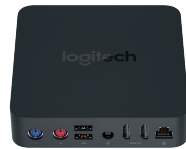
SmartDock Extender Box