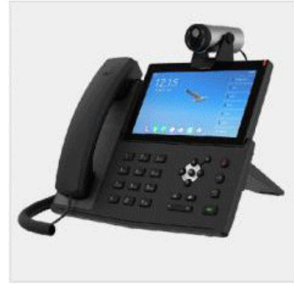
XT-40G Android IP Phone with Camera