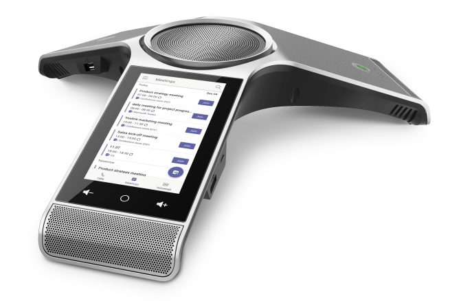
Android OS 3-Microphone Array